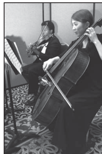
Members of the Oklahoma Arts Institute Orchestra perform at a pre-banquet reception. The orchestra, made up of students and alumni of the Summer Arts Institute, is a featured highlight of the annual banquet.