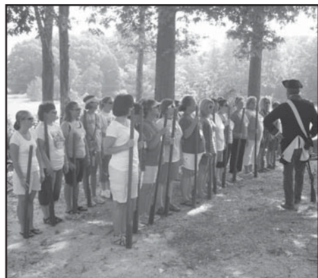
During a visit to the Yorktown Battlefield, a delegation of Oklahoma teachers learns what it was like to be a soldier in Gen. George Washington's Continental Army. Twenty-five teachers received scholarships from the Oklahoma Foundation for Excellence to attend the Colonial Williamsburg Teacher Institute this summer. For more photos and teacher comments, visit www.ofe.org .

The Foundation wishes to thank INTEGRIS Health, Inc. for its generosity in printing this publication.