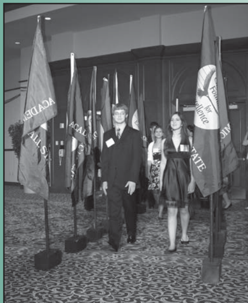
The 2008 Academic All-Staters begin their grand procession into the ballroom for the academic awards ceremony.