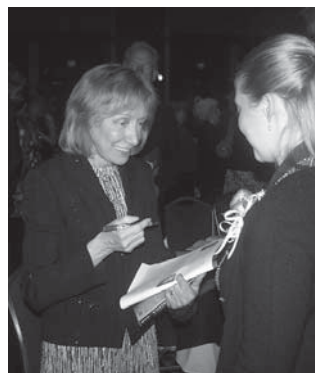
Doris Kearns Goodwin signs a banquet program for an Academic All-Stater.

DVDs of the Academic Awards Banquet are available for $12 each. Checks should be made payable to the Oklahoma Foundation for Excellence, 120 N. Robinson, Suite 1420-W, Oklahoma City, OK 73102.