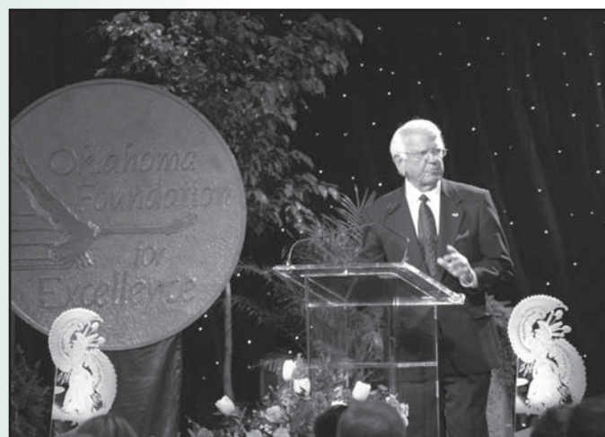
Former Oklahoma Gov. George Nigh serves as master of ceremonies for the gala celebration.