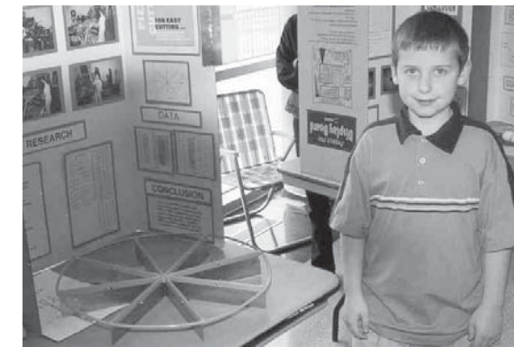
A young inventor displays his even-slice pizza slicer.

Judges for the competition include patent attorneys and service men and women from Tinker Air Force Base. Up to $15,000 in cash awards and