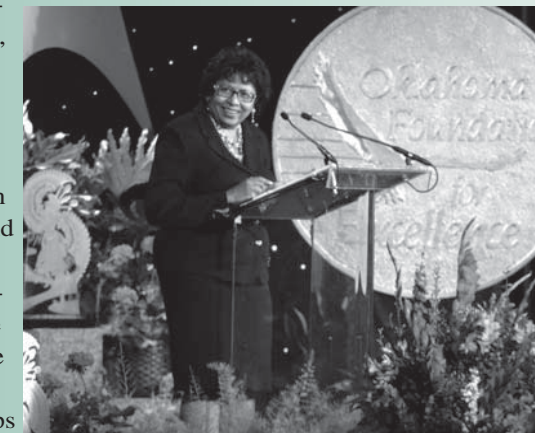
Brown University President Ruth Simmons delivers the banquet's keynote address.

A transcript of Simmons' speech and profiles of this year's honorees can be seen online at www.ofe.org .