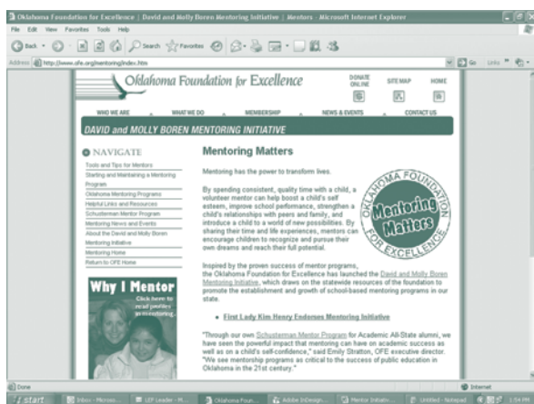
The new Web site for the David and Molly Boren Mentoring Initiative at www.ofe.org/mentoring provides information on how to coordinate a successful mentoring program and resources for prospective volunteers, including a directory of Oklahoma Mentoring Programs.