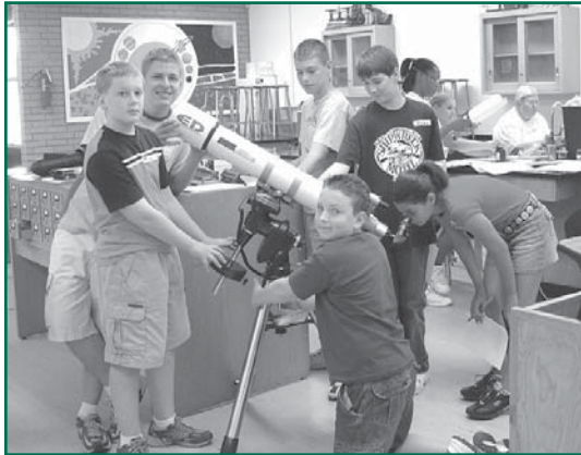
Clinton students demonstrate one of the new telescopes purchased through a grant from the Clinton Public Schools Foundation.