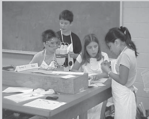
To stimulate and encourage honor students transitioning from fifth grade to middle school, the Poteau Schools Education Foundation sponsors the Academic Quest Program. Students who are entering the sixth grade and rank in the top 30 percent of their class are eligible to participate in this week-long program held immediately before the beginning of a new school year. The purpose is to further enhance the student's learning opportunities by providing leadership skills, hands-on science, computer technology, problem solving, and humanities in the arts and foreign language.

semester. The grants are being used for equipment and projects, ranging from technology that enables students to study behavior and radio telemetry to enrollment in a plagiarism prevention system and service with classroom management tools.